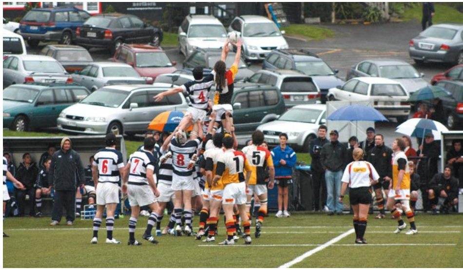
Action from the Barbarian northern region tournament, held at College Rifles RFC in September.