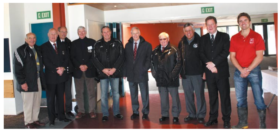
A strong contingent of Barbarians and good rugby people in Rotorua.