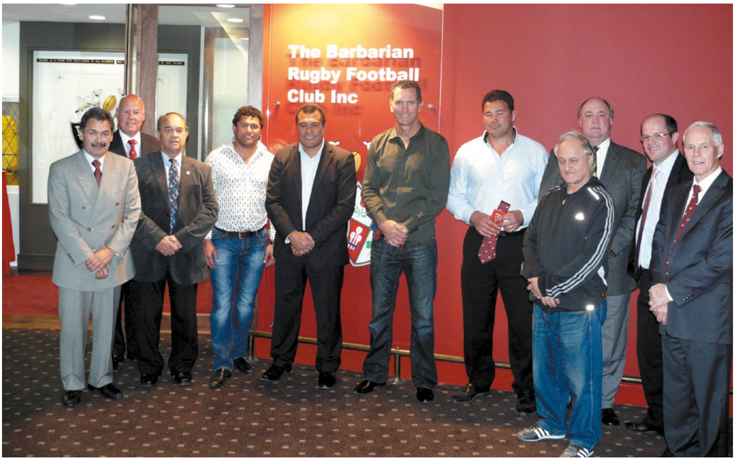
Some of the new Barbarian members at the October inauguration.