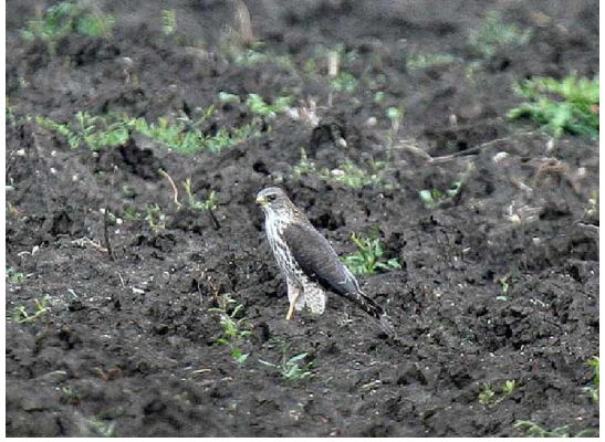
Levant Sparrowhawk, Atanasovsko

Species at this site included White Pelican, Dalmatian Pelican, Squacco Heron, Night Heron, Spoonbill, Ruddy Shelduck, Garganey, Osprey, Short-toed Eagle, White-tailed Eagle, Hobby, Red-footed Falcon, Bee Eater, Hoopoe, Roller, Golden Oriole, and Great Reed Warbler.