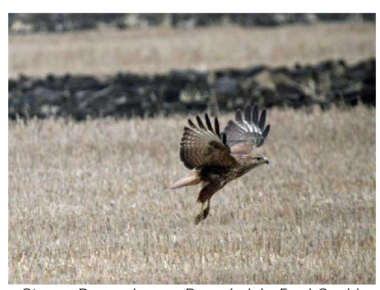
Steppe Buzzard, near Durankulak