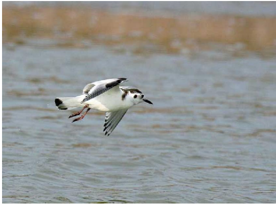
Little Gull, Pomorie, Fred Gould