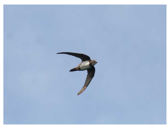
Alpine Swift, Kaliakra