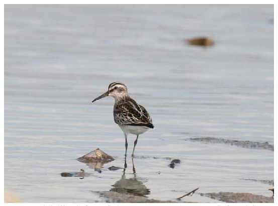
Broad-billed Sandpiper, Pomorie, Fred Gould

This 100 hectare nature reserve run by the Bulgarian Society for the Protection of Birds was the only really new site we visited. Poda is situated south of Burgas just off the E87, the road to Sozopol, about 2km before the turn for Kreimorie. It's impossible to access from the southbound carriageway; if you're coming from the Burgas direction, best to carry on to the Kreimorie turn-off and come back on yourself but take care not to miss that turning, as we did, it's a long way to the next junction! Even approaching from the south, though signposted, it's easily missed. Look out for the flat-roofed information centre building. The habitat includes fresh, brackish and salt water lagoons with extensive reedbeds and there's a nature trail and a couple of hides, one of which overlooks some nice wader habitat if the water level is not too high as it was on our second visit. There's an entrance fee of 3.60 Levs per person; by no means expensive and in a worthy cause. The information centre, staffed by volunteers, boasts a rooftop viewing platform, sheltered from the sun, giving excellent views over the reserve as well as selling a range of goods including welcome cold drinks. The reserve has its own website at http://www.bspb-poda.de/sites/english/home/home.htm Species seen here on our two visits included Pygmy Cormorant, White Pelican, Great White Egret, Purple Heron, Garganey, Osprey, Honey Buzzard, Marsh Harrier, Broad-billed Sandpiper, Caspian Tern, Black Tern and Penduline Tit.