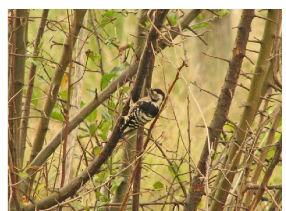
Lesser Spotted Woodpecker, Sablenska Tuzla, Dave Thexton