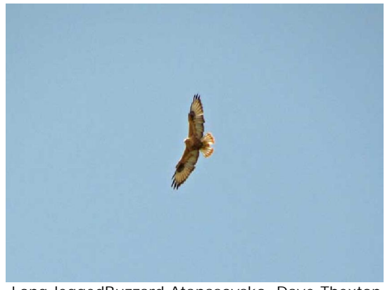
Long-leggedBuzzard, Atanasovsko