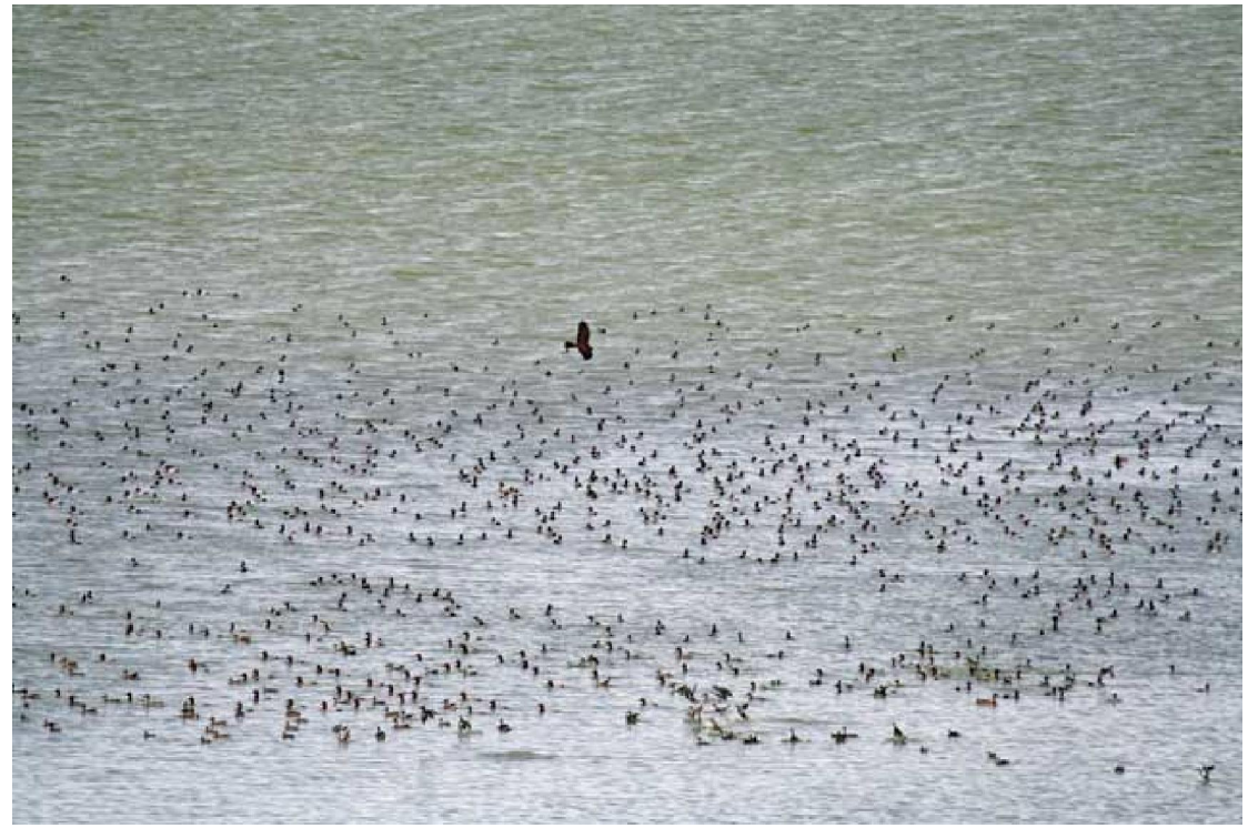
Marsh Harrier causing panic at Burgas Lake