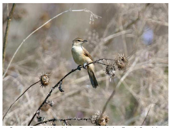
Great Reed Warbler, Durankulak, Fred Gould

Again, we found access to the lake itself difficult and we were largely limited to rather distant views though we did manage to view some good wader habitat by stopping on the slip road to the southbound E87 dual carriageway. Possibly illegal but no-one seemed to mind and it did enable us to see a flock of 100 Marsh Sands amongst other things. As last year, our raptor watching was mostly done from an area almost due west of Burgas Airport from a driveable track heading west immediately after the beginning of the road leading to Cerno More. Species around the lake and our raptor watching site just inland included White Pelican, Dalmatian Pelican, Purple Heron, Great White Egret, Black Stork, White Stork, Honey Buzzard, Long-legged Buzzard, Steppe Buzzard, Pallid Harrier, Hen Harrier, Levant Sparrowhawk, Goshawk, Lesser Spotted Eagle, Short-toed Eagle, Booted Eagle, Osprey, Hobby, Red-footed Falcon, Eleanora's Falcon, Quail, Marsh Sandpiper, Slender-billed Gull, Whiskered Tern, Bee Eater, Alpine Swift, Red-throated Pipit, and Lesser Grey Shrike.