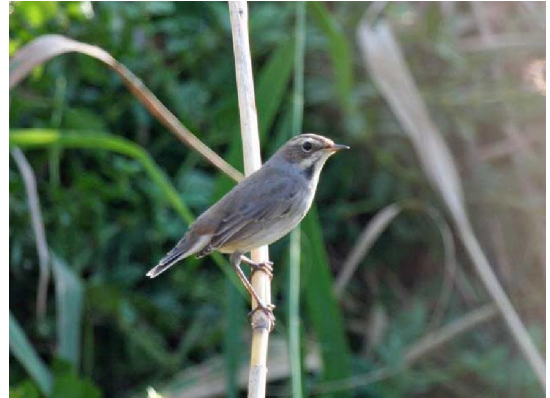
Bluethroat, Sabla Lake, Fred Gould

Perhaps best included as part of this site was an area of steppe like habitat just outside the village of Balgarevo which we visited for the first time this year, Access is easy as the area is criss-crossed by a network of driveable tracks. Our one late afternoon/early evening visit produced large numbers of Calandra Larks and a high density of Tawny Pipits, plus Golden Plover, Stone Curlew and a Redfooted Falcon. This is the area where some people have seen Dotterel in the past.