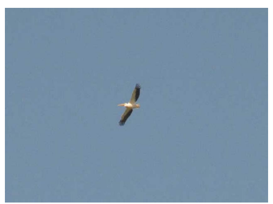
White Pelican, Burgas Lake, Dave Thexton

An area of marsh next to the E87 west of Pomorie. Not easy to view as you either have to stop illegally on the side of the westbound carriageway of the busy E87 or park on the coast, where there is ample room to get off the road, but then cross the E87 on foot and stand at the roadside as the traffic whizzes by. Unsurprisingly, our stops here tended to be brief but still produced good numbers of Little Egrets, a Purple Heron, a Marsh Sandpiper and a few other waders. One of our regular rituals was to count the Little Egrets as we sped past heading west!