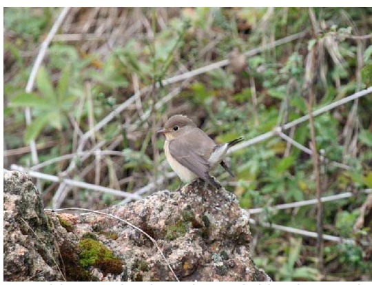
Red-breasted Flycatcher, Sablenska Tuzla, Fred Gould

We also spent a short time in woodland and scrub inland from Atanasovsko in the hills between Balgorovo and Rudnik, where species included Wryneck. In addition, we made several stops in woodland between Pomorie and Varna on the days that we travelled between our two bases, basically just pulling off the main road onto side tracks wherever the habitat looked decent. This produced White Stork, Honey Buzzard, Black Kite, Montagu's Harrier, Hobby, Bee Eater, Roller, Syrian, Middle and Lesser Spotted Woodpecker, Red-breasted Flycatcher and a selection of common (common in Britain anyway) woodland birds that were new for the trip.