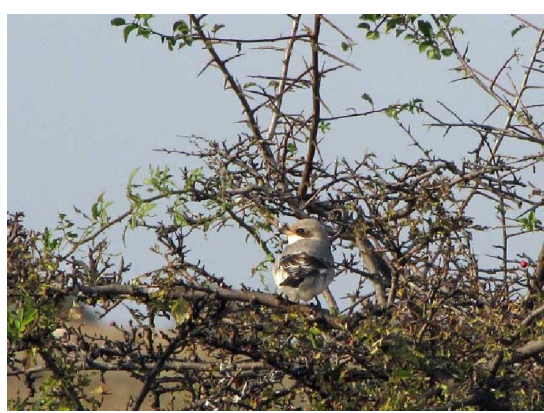
Lesser Grey Shrike, Kaliakra, Ian Kinley

Perhaps best included as part of this site was an area of steppe like habitat just outside the village of Balgarevo which we visited for the first time this year, Access is easy as the area is criss-crossed by a network of driveable tracks. Our one late afternoon/early evening visit produced large numbers of Calandra Larks and a high density of Tawny Pipits, plus Golden Plover, Stone Curlew and a Redfooted Falcon. This is the area where some people have seen Dotterel in the past.