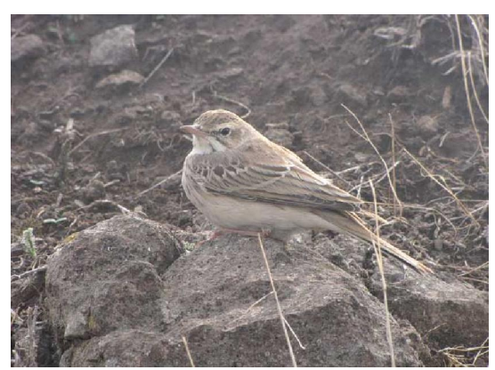
Tawny Pipit, near Cerno More, Ian Kinley