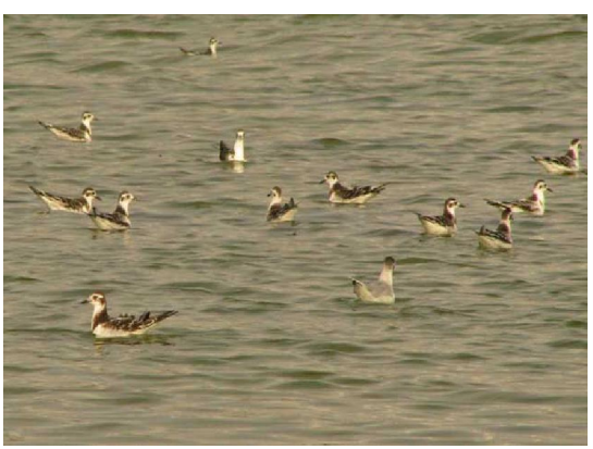
Little Gulls at Pomorie, Dave Thexton