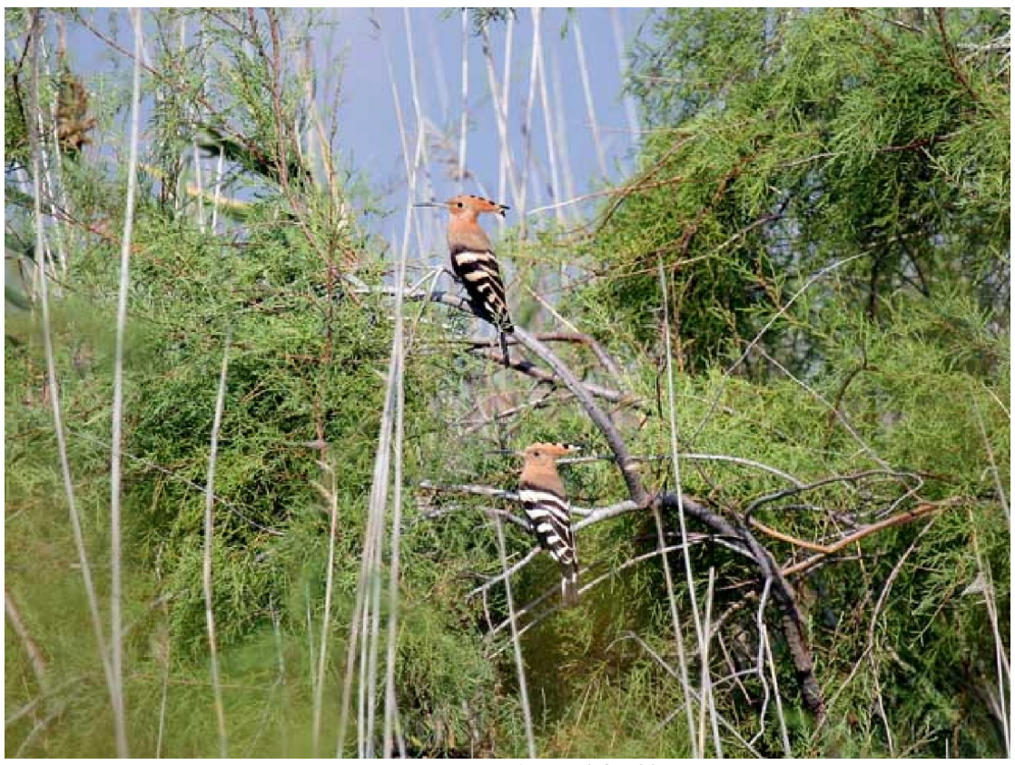
Hoopoes, Pomorie