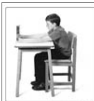
Seated postures that relieve the STNR impulse