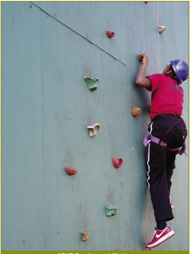
ADHD Development Worker: Activities in Preventative strategy