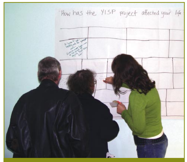
Youth Inclusion Support Panel: Parents involved in evaluating YISP

Looking at these risk factors can also help to identify how many of the other Children's Fund funded projects play a part in a preventative strategy to address youth crime.