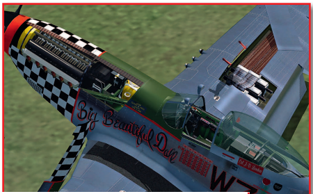
The port engine cowling and starboard wing ammunition panels detach. With the cowling open, the pilot disappears from the cockpit

In firing up the Merlin from a 'cold and dark' state there is a trap for the unwary: overprime her and huge sheets of flame belch out of the exhausts, just as in the real aircraft. The virtual engine sounds incredibly real, and you can almost feel the vibration in the airframe.