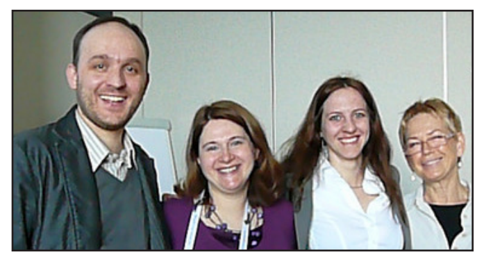
Participants at the Slovenia World Congress, March 2009