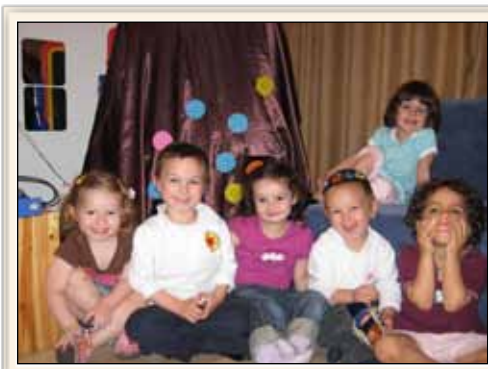
● The tots at Mount Sinai

At Pudong Hebrew School, discovering and experiencing Judaism in exciting ways is a reality. When students embark on a "Kosher Hunt" at a local supermarket or put on a theatrical presentation of the Purim story, Judaism remains engraved in their tender young memories.