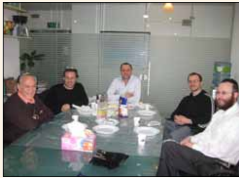
● Tefillin Club enjoy bagels and lox