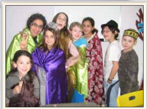
● Lights, Camera, action... the Purim Play