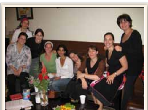
● What an enjoyable evening!