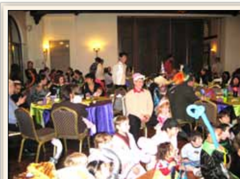
● The Purim Feast

Mom and tots, children and adults alike came to the Purim party this year in full Purim disguises. The atmosphere was very festive, with a large crowd staying on well into the night to dance and have fun.