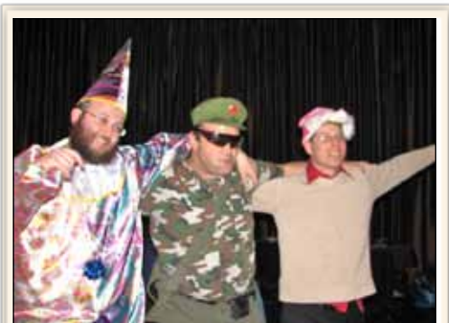
● Celebrating Purim to its fullest