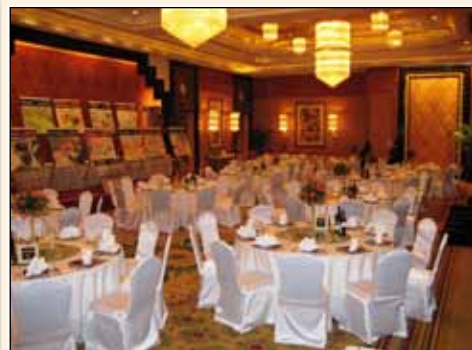
● Passover Seder at the Renaissance