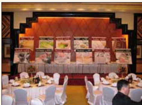
● 15 Seder steps to be unveiled

The Pudong community Seder was once again celebrated this year as one big family. The innovative twist of the evening was that, families were honored to unveil big beautiful posters explaining the different steps of the Seder.