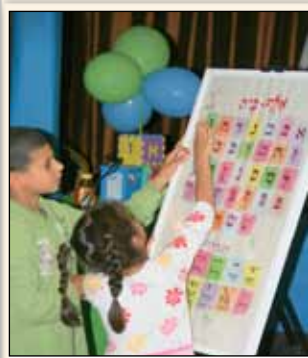
● The Ashery children testing each other