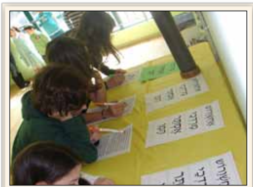
● Finding Hebrew names in the Megilla text