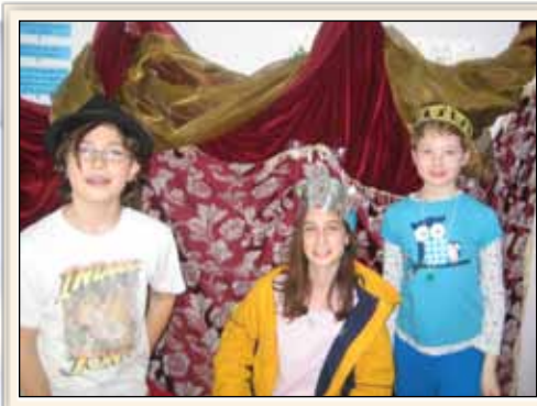
● Students decorate the school