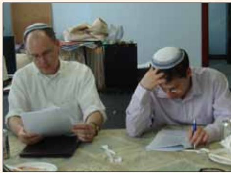
● Participants engaged in the lesson