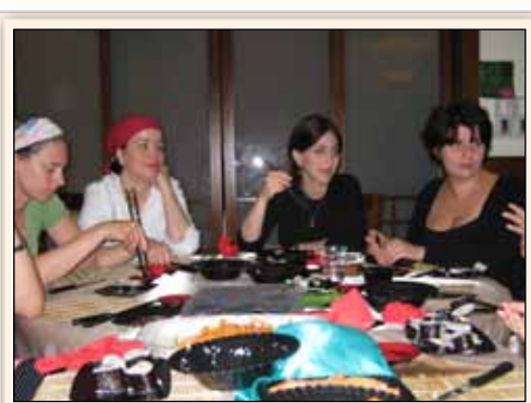
● Learning the art of sushi making

The Jewish Women's Circle enjoyed their last gathering before the summer with sushi making and tasting. The evening ended with a talk on astrology in Judaism.