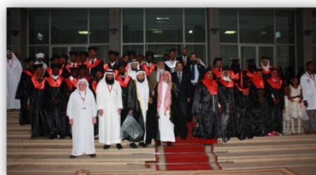
Graduates with Guest of honor and special invitees

The Ophthalmic assistant programme is a 3 year diploma course called -Diploma in Ophthalmic assistant (DOA). It is recognized by the Council of Medical Profession of Sudan. This cadre of eye care workers is highly needed not only in Sudan but many parts of EMR and Africa.