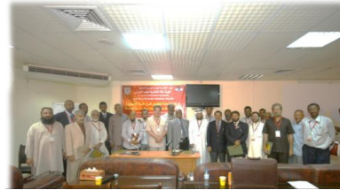
HR Workshop participants

PBU congratulates Al Basar international foundation for the attainment of this feat towards bridging the human resource gap in the EMR region.