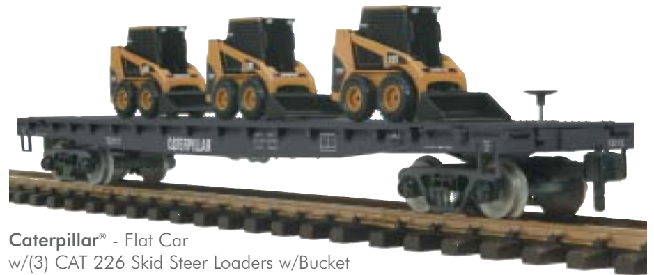
Caterpillar® - Flat Car w/(3) CAT 226 Skid Steer Loaders w/Bucket 70-76042 $119.95