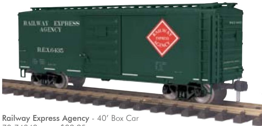
Railway Express Agency - 40' Box Car 70-74048 $89.95