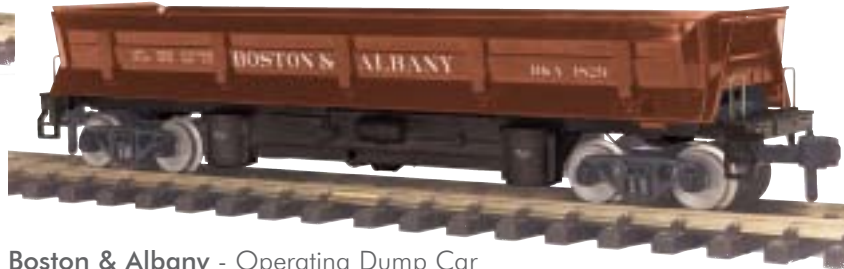
Boston & Albany - Operating Dump Car 70-79014 $149.95