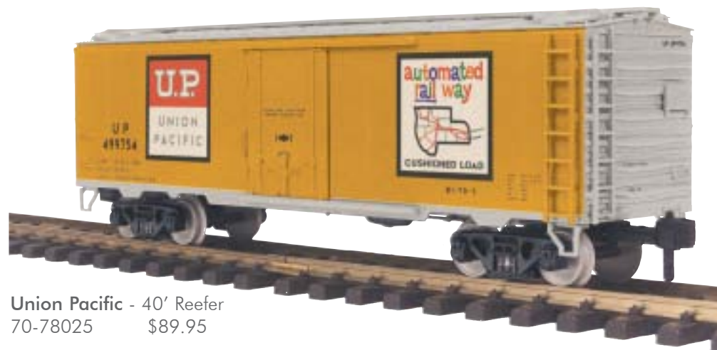
Union Pacific - 40' Reefer 70-78025 $89.95