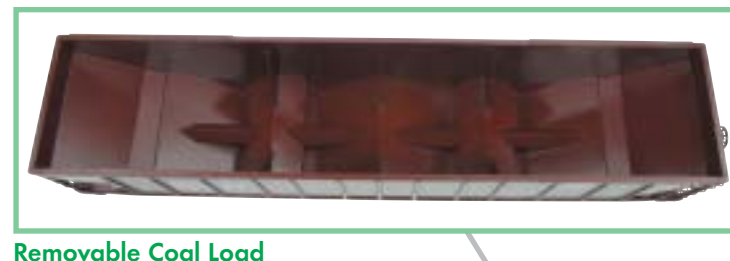
Removable Coal Load

* Not all RailKing One Gauge freight cars feature similar details as those found on the 4-bay hopper.