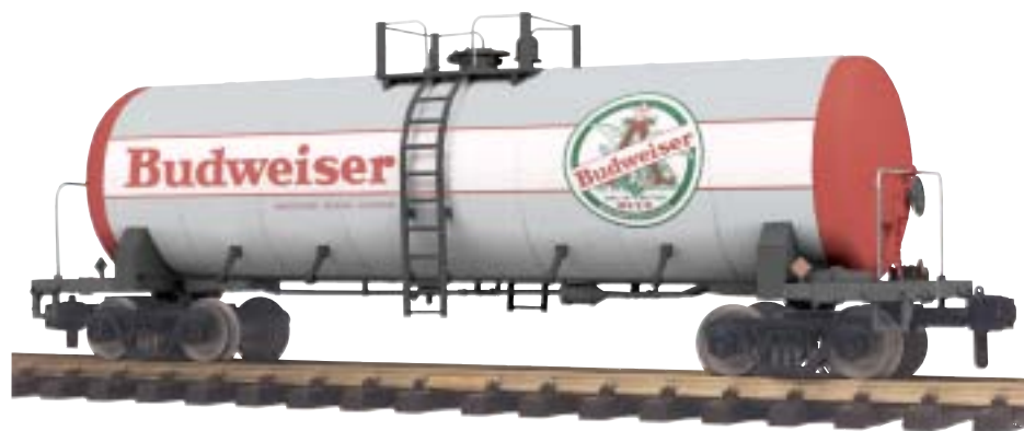
Budweiser - Unibody Tank Car 70-73028 $99.95

© 2007 Anheuser-Busch, Inc. All Rights Reserved.