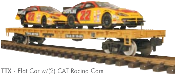
TTX - Flat Car w/(2) CAT Racing Cars 70-76049 $119.95