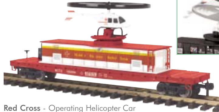
Red Cross - Operating Helicopter Car 70-79012 $179.95