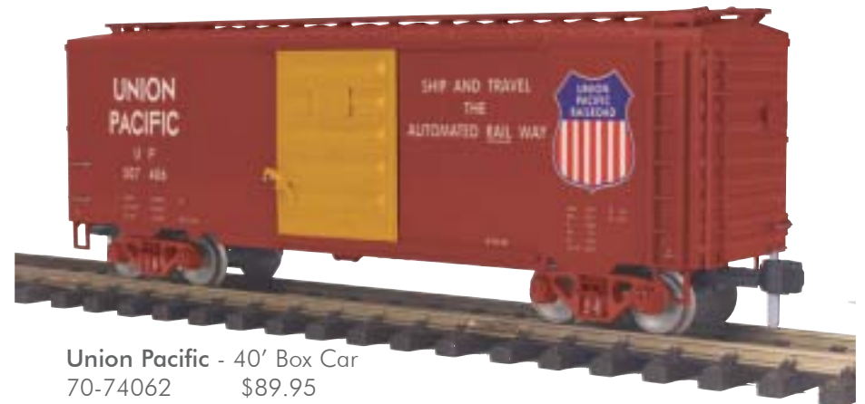
Union Pacific - 40' Box Car 70-74062 $89.95