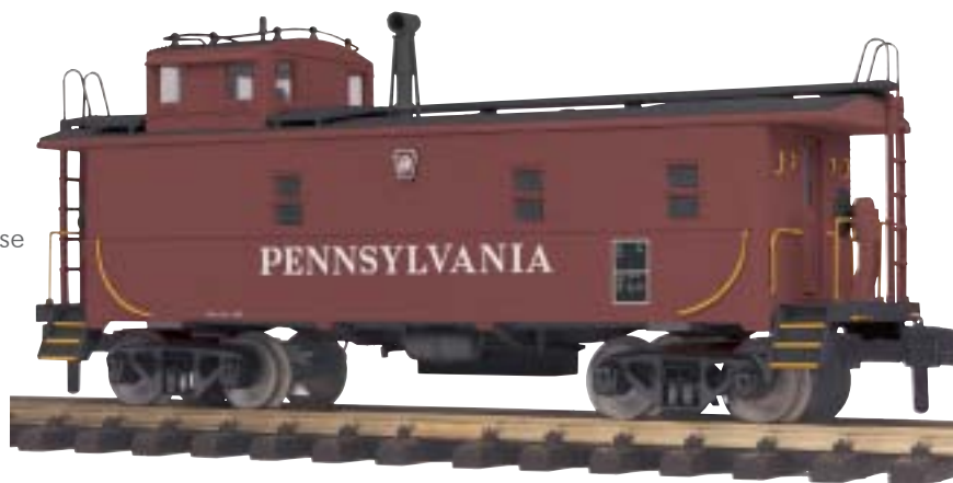
Pennsylvania - Offset Steel Caboose 70-77025 $129.95