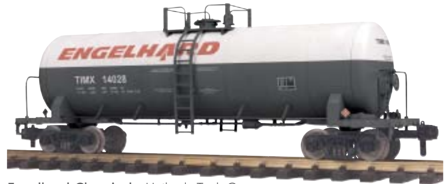
Engelhard Chemical - Unibody Tank Car 70-73024 $89.95