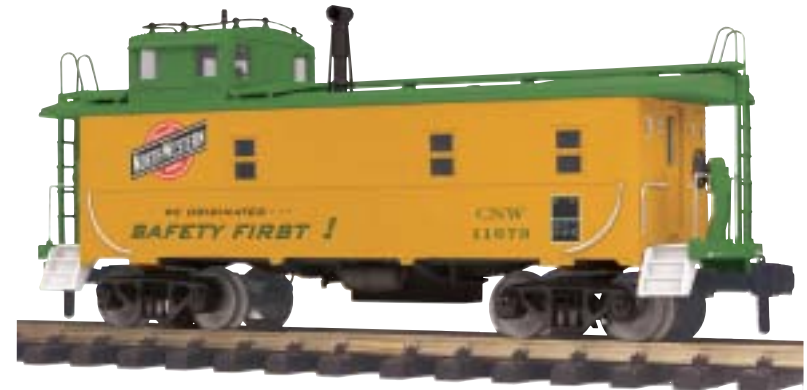
Chicago NorthWestern - Offset Steel Caboose 70-77020 $129.95