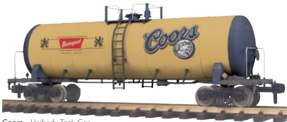
Coors - Unibody Tank Car 70-73026 $99.95

© 2007 Molson Coors Global Properties, LLC Coors trademarks are properties of Molson Coors Global Properties, LLC, used under license by M.T.H. Electric Trains. Limited Edition Adult Collectible-This licensed product is intended for purchase and enjoyment by individuals of legal purchase age for alcohol beverages