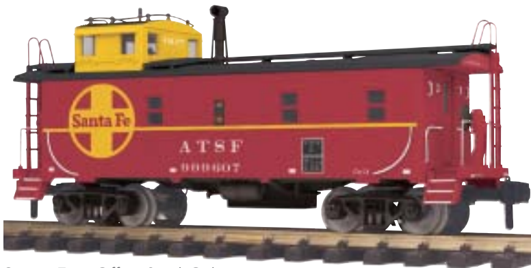
Santa Fe - Offset Steel Caboose 70-77019 $129.95