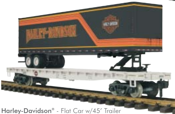
Harley-Davidson® - Flat Car w/45' Trailer 70-76031 $99.95