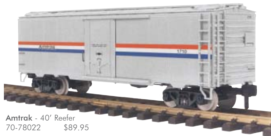
Amtrak - 40' Reefer 70-78022 $89.95