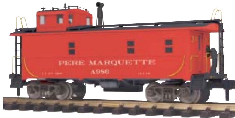
Pere Marquette - Offset Steel Caboose 70-77014 $129.95