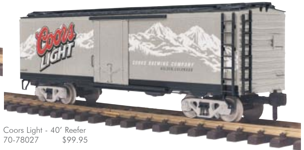
Coors Light - 40' Reefer 70-78027 $99.95

© 2007 Molson Coors Global Properties, LLC Coors trademarks are properties of Molson Coors Global Properties, LLC, used under license by M.T.H. Electric Trains. Limited Edition Adult Collectible-This licensed product is intended for purchase and enjoyment by individuals of legal purchase age for alcohol beverages