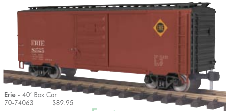
Erie - 40' Box Car 70-74063 $89.95