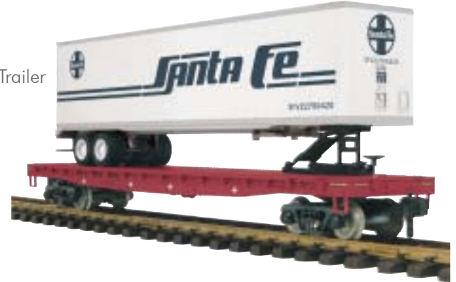
Santa Fe - Flat Car w/45' Trailer 70-76048 $99.95