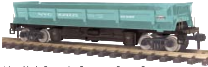
New York Central - Operating Dump Car 70-79015 $149.95