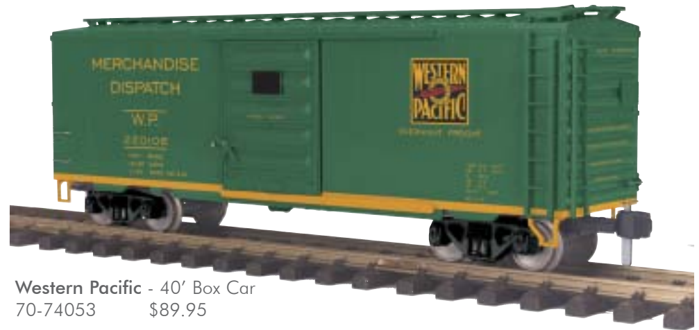
Western Pacific - 40' Box Car 70-74053 $89.95