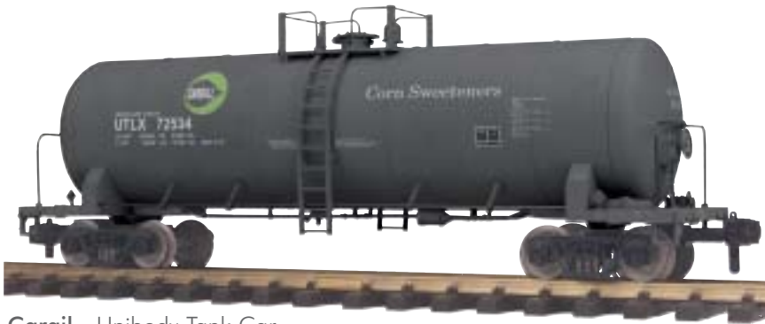
Cargil - Unibody Tank Car 70-73023 $89.95