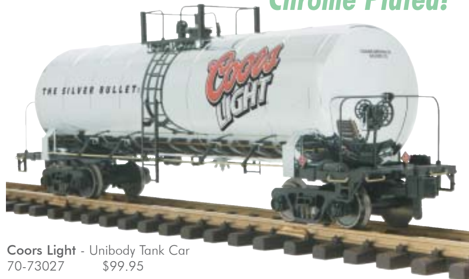
Coors Light - Unibody Tank Car 70-73027 $99.95