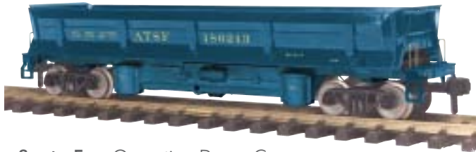
Santa Fe - Operating Dump Car 70-79017 $149.95