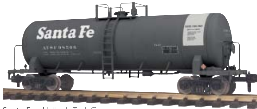
Santa Fe - Unibody Tank Car 70-73025 $89.95