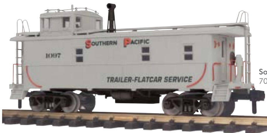
Southern Pacific - Offset Steel Caboose 70-77024 $129.95

© 2007 H-D, All Rights Reserved. Manufactured by M.T.H. Electric Trains under license from Harley-Davidson Motor Company. © 2007 M.T.H. Electric Trains 7020 Columbia Gateway Drive, Columbia, Maryland 21046