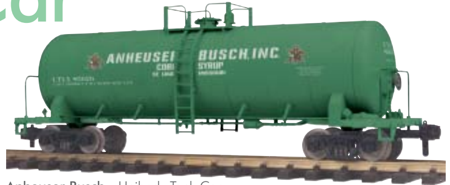
Anheuser Busch - Unibody Tank Car 70-73022 $99.95

© 2007 Anheuser-Busch, Inc. All Rights Reserved.