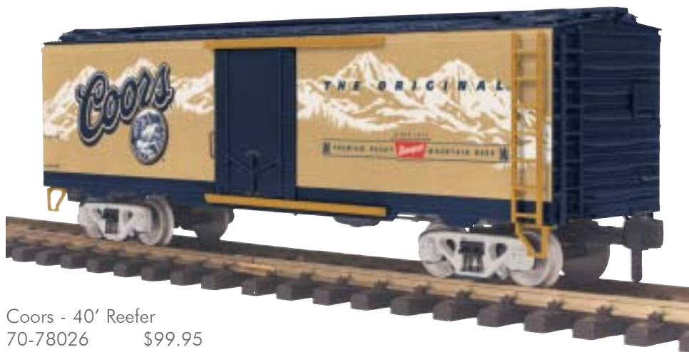
Coors - 40' Reefer 70-78026 $99.95

© 2007 Molson Coors Global Properties, LLC Coors trademarks are properties of Molson Coors Global Properties, LLC, used under license by M.T.H. Electric Trains. Limited Edition Adult Collectible-This licensed product is intended for purchase and enjoyment by individuals of legal purchase age for alcohol beverages