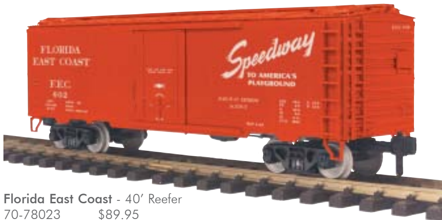
Florida East Coast - 40' Reefer 70-78023 $89.95