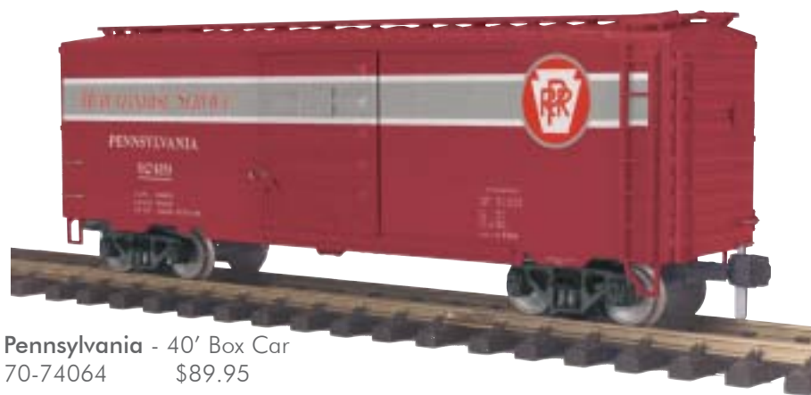
Pennsylvania - 40' Box Car 70-74064 $89.95