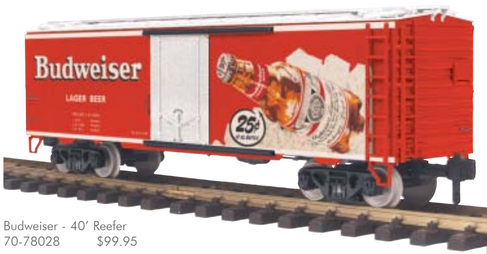
Budweiser - 40' Reefer 70-78028 $99.95

© 2007 Anheuser-Busch, Inc. All Rights Reserved.