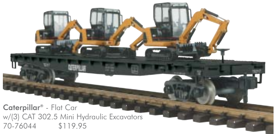
Caterpillar® - Flat Car w/(3) CAT 302.5 Mini Hydraulic Excavators 70-76044 $119.95