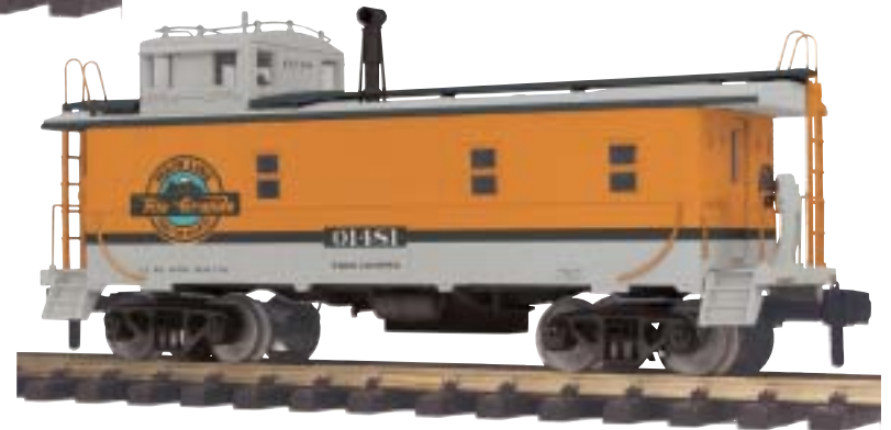
Denver Rio Grande - Offset Steel Caboose 70-77026 $129.95