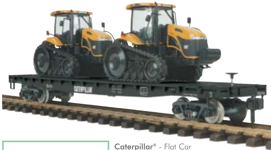
Caterpillar® - Flat Car w/(2) CAT MT765 Challenger Tractors 70-76041 $119.95