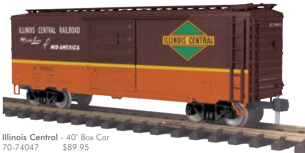
Illinois Central - 40' Box Car 70-74047 $89.95