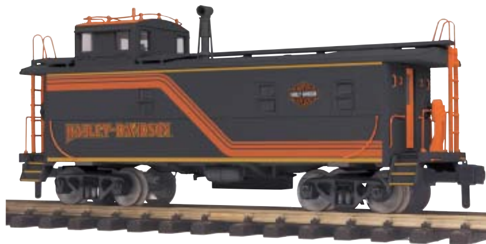
Harley-Davidson® - Offset Steel Caboose 70-77022 $129.95