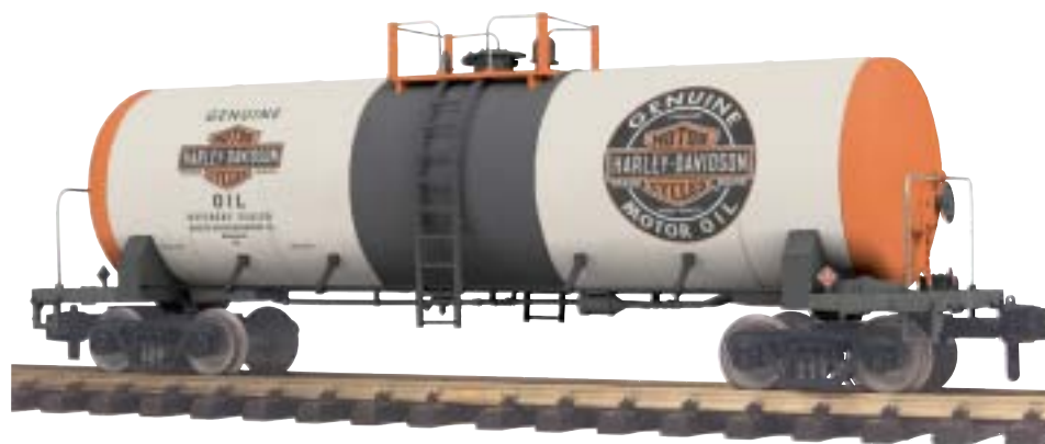
Harley-Davidson® - Unibody Tank Car 70-73029 $99.95

© 2007 Anheuser-Busch, Inc. All Rights Reserved.