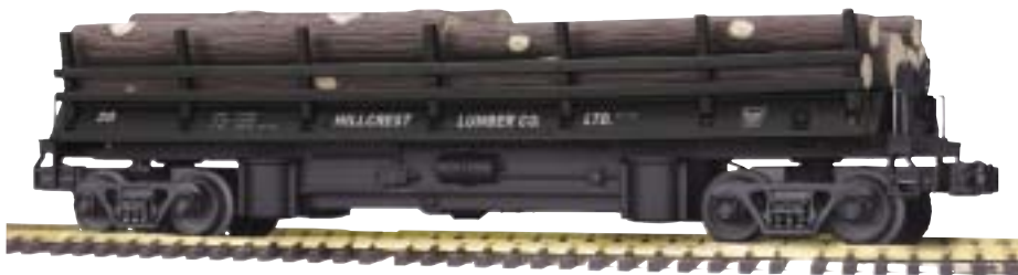
Hillcrest Lumber Company - Operating Log Dump Car 70-79003 $149.95