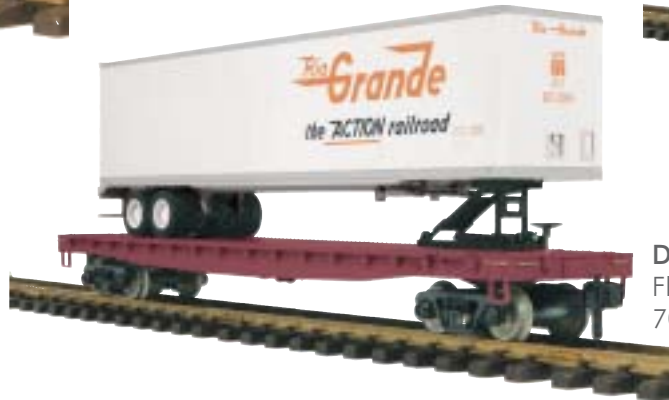
Denver and Rio Grande Western Flat Car w/45' Trailer 70-76046 $99.95