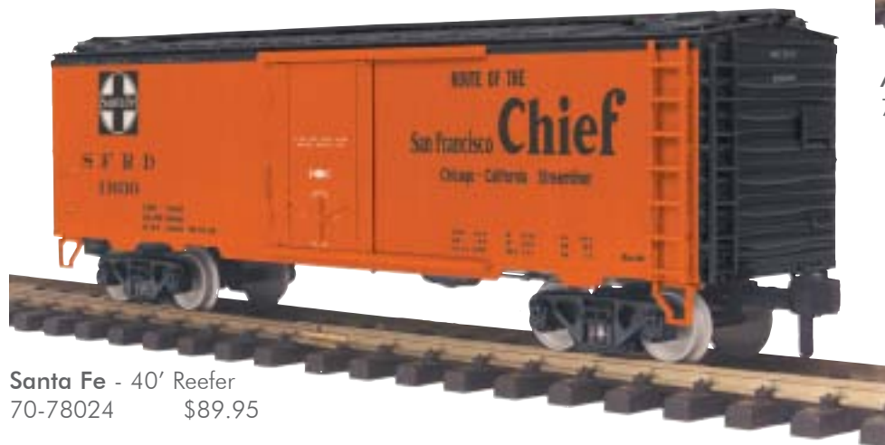
Santa Fe - 40' Reefer 70-78024 $89.95