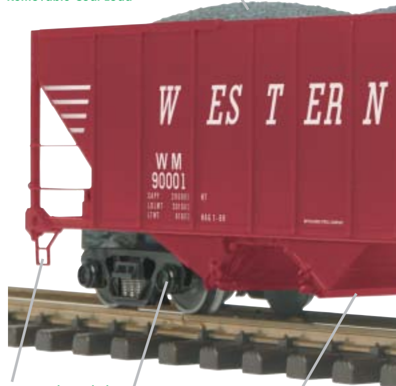
Accurately Scaled Metal Steps

Smooth Rolling Sprung Trucks make it easy for your engines to pull longer trains. Our highly detailed trucks feature metal wheels and axles.