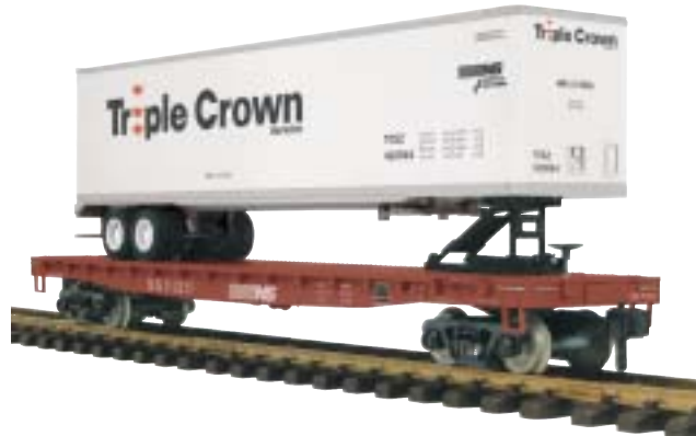
Norfolk Southern - Flat Car w/45' Trailer 70-76047 $99.95