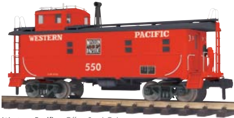
Western Pacific - Offset Steel Caboose 70-77027 $129.95