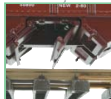
Opening Hopper Doors

Smooth Rolling Sprung Trucks make it easy for your engines to pull longer trains. Our highly detailed trucks feature metal wheels and axles.