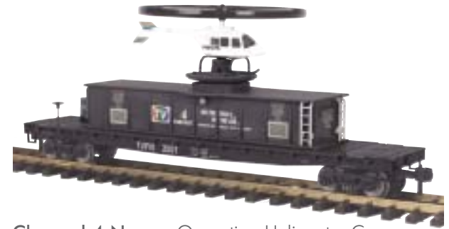
Channel 4 News - Operating Helicopter Car 70-79013 $179.95

Operating cars require 70-14008 Operating Track Section Kit for activation (see page 47)