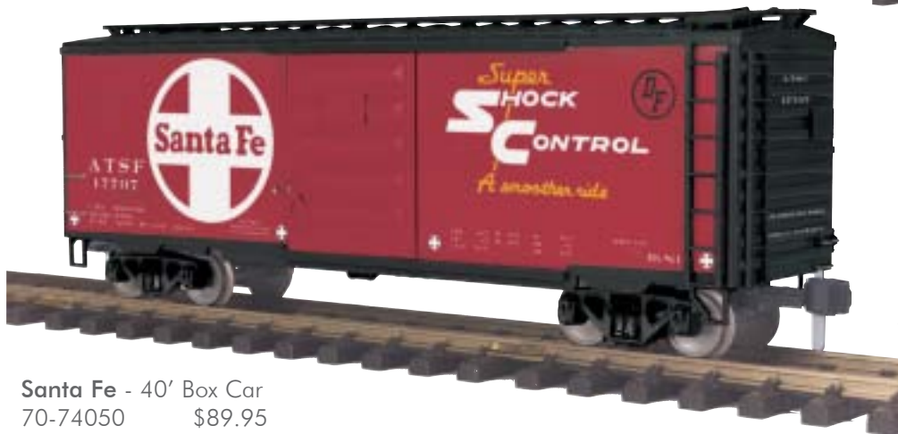
Santa Fe - 40' Box Car 70-74050 $89.95