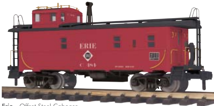
Erie - Offset Steel Caboose 70-77023 $129.95