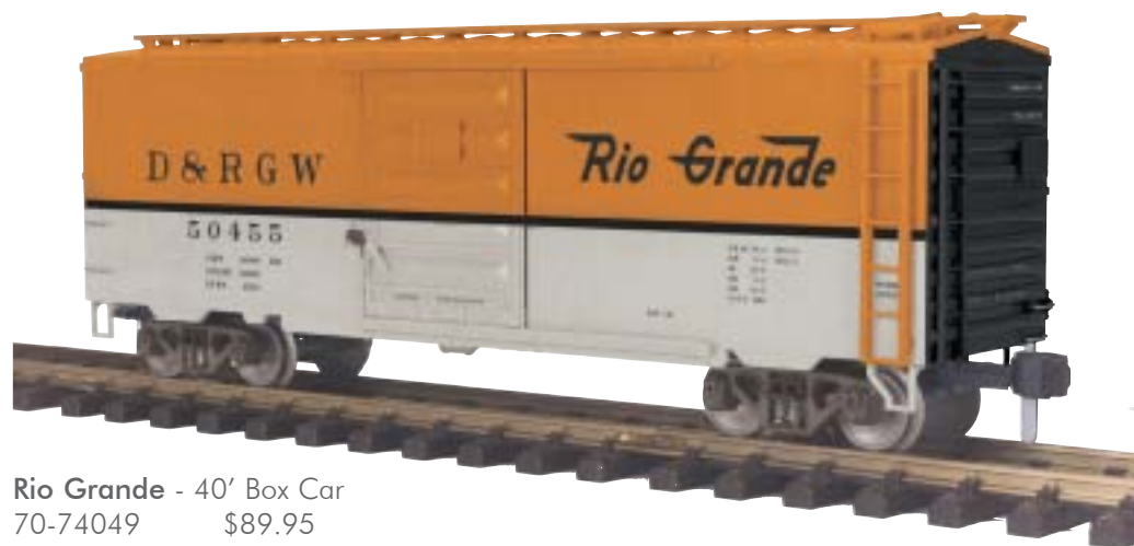
Rio Grande - 40' Box Car 70-74049 $89.95