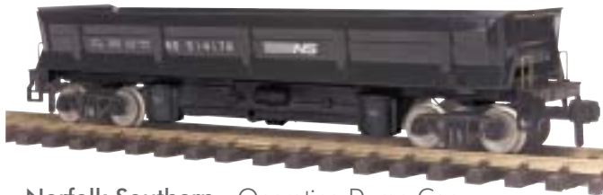
Norfolk Southern - Operating Dump Car 70-79016 $149.95