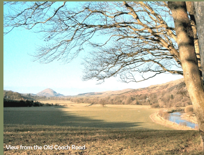
View from the Old Coach Road

Wooden signpost on the B7044 about 1/4 mile from the junction with the B734. Way leads down a track and then along the field beside a very beautiful part of the river. Return by the same path.