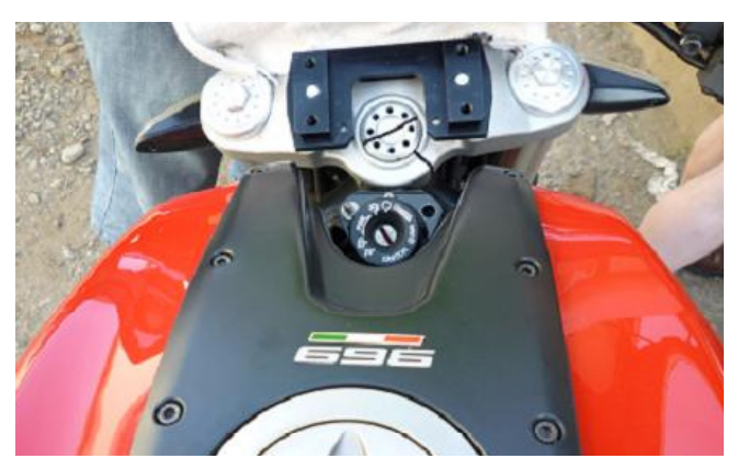
1. Dismount completely the handlebar mount and mount part 139/1, unscrew nuts M6 near the ignition box and remove the plastic cover.