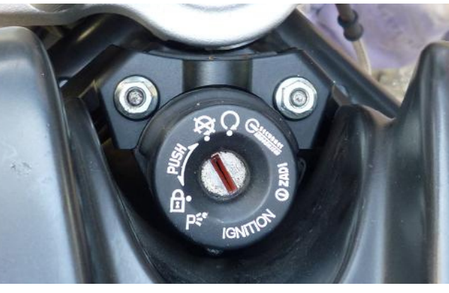
2. On the tank to the ignition box mount part 139/2 and secure with original nuts M6 (3). Mount the shock absorber to part 139/1, secure with screws M6x20. Gradually mount parts 139_2,139_4 and handlebars. Secure everything with screws M8x45.