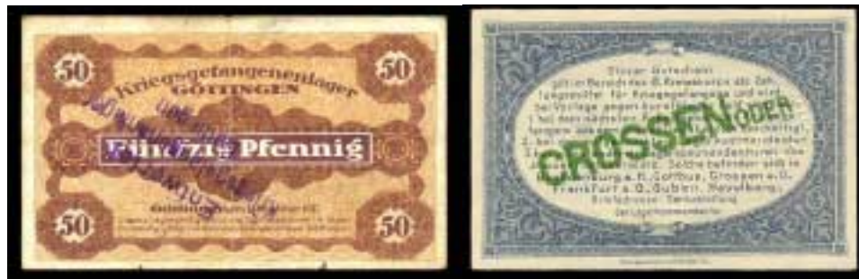
POW Money from Gottingen and Crossen 1918