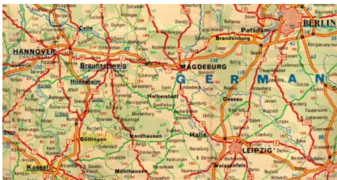
Showing where grandad was held as a POW.

He was found and taken prisoner by the advancing Germans and taken first to their field hospital where he underwent various patching operations before being transferred to Gottingen Infirmary part of the Gottingen POW camp.