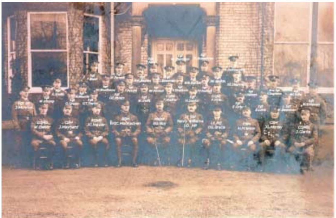
Taken between Oct & Dec. 1915 – either Long Benton or Gainsborough The men of 2/4 th Battalion N.Yorks and some that never returned.