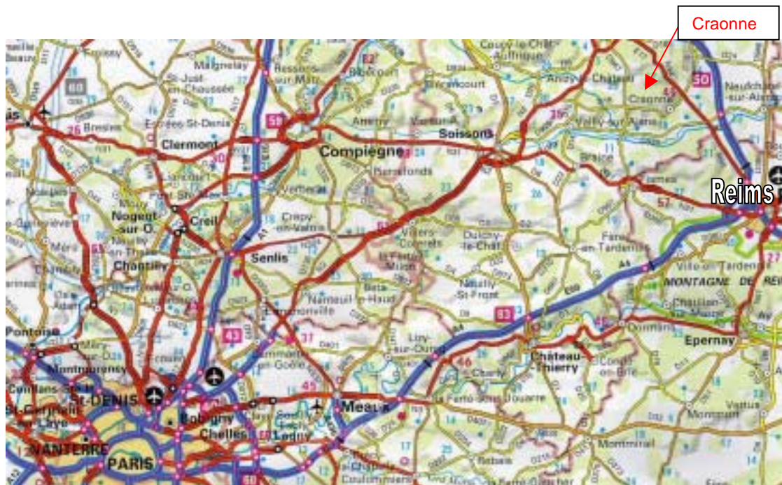
Craonne - where Grandad was wounded and captured

Grandad was wounded in the head as he was rounding up stragglers endeavouring to escape the encircling enemy. Whilst under constant machine gun fire and hurrying them along he swore he saw the sun glinting on the rounds just before they hit him and he went down thinking it was the end.