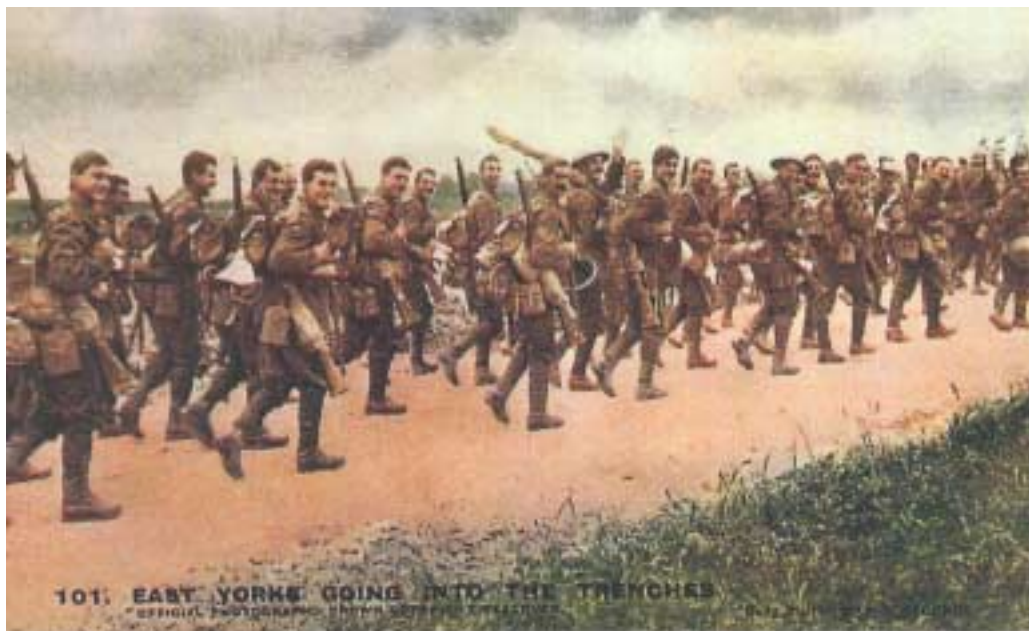
The East Yorks. 150 th Divn. who were relieved by the 6 th D.L.I on the 31 st October H.Q. Egypt House.