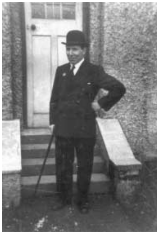
Grandad – circa 1936

My thanks to all my who helped make this document possible and who gave freely of their time, information and allowed copies of their personal documents.