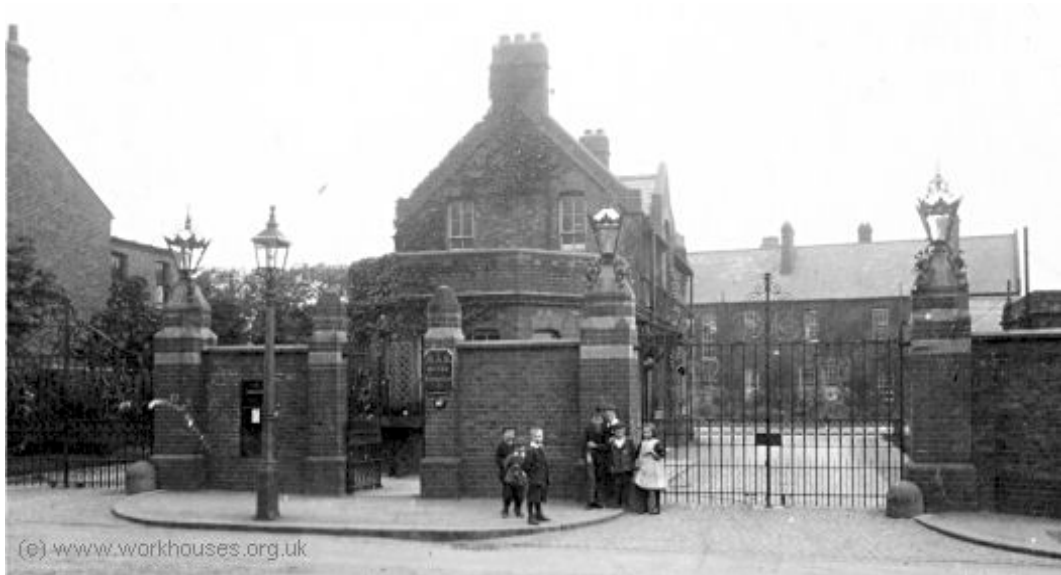
The old Tooting Grove Military Hospital circa 1917

Apart from the physical scars on his face, the entry and exit wounds, he had a deeper psychological condition that was to show itself at various times throughout his life with periods of sickness and what would possibly be termed today as flashbacks and ramblings.