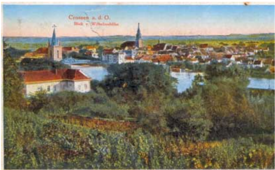
Old view of the village Crossen am den Order

He remembers being marched to the various POW camps and the watching women weeping at the sight of so many walking wounded. What a sight they were, ragged, dishevelled, dirty and crippled. When asked about the food in the camp he would simply say, "they gave us what they had" He also remembers the prison guards, if they were Saxon's they were O.K but if Prussians they were swine's and very arrogant. His first camp was Gottingen Lager in Hannover, then he was moved to Cassel Lager in June 1918. From there he was transferred to Crossen am den Oder Lager in Brandenburg.