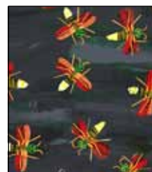
4346-K 1⅛ yards (includes binding)