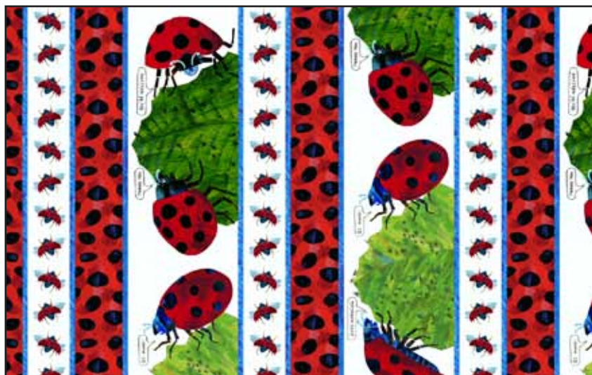
5380-M 2 yards