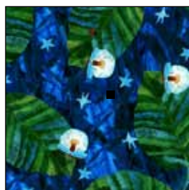
5381-B ⅔ yard