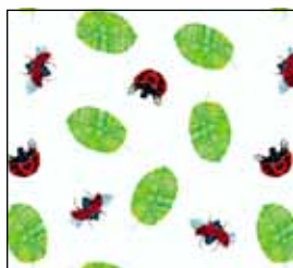
5382-M 1¼ yard (extra yardage needed for backing)